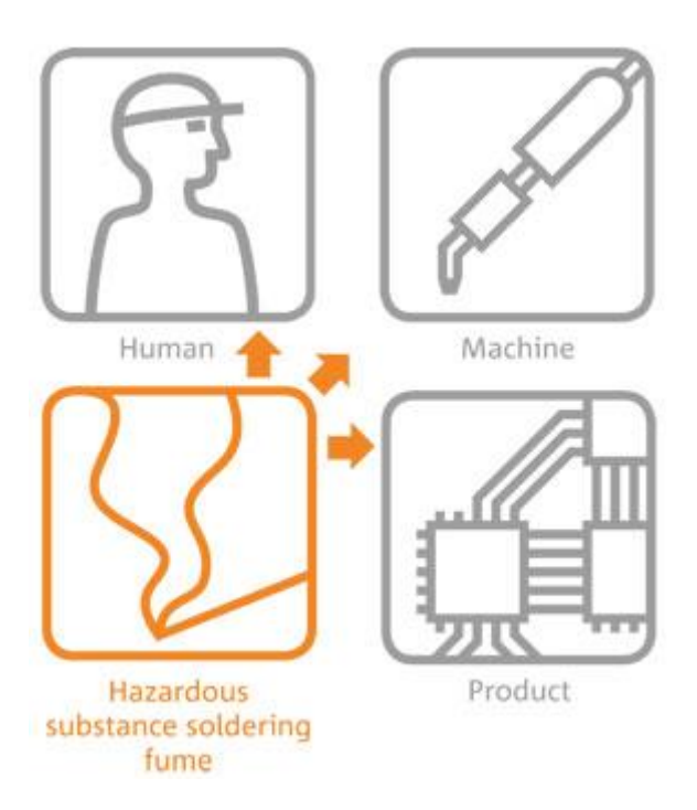
The threefold damaging effect of solder fume

In conventional wave soldering processes, the entire printed circuit board is fluxed. The emerging spray mists from alcohol-based flux and other evaporations may lead to explosive, highly flammable vapour/air mixtures.