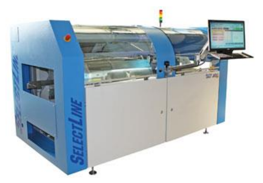
Selective soldering plant

In the production of electronic assemblies, almost only soft soldering is used. The melting temperature of the solder is lower than the melting temperature of the elements to be joined, e.g., component leads to PCB pads - (approx. 180 to 260 °C). The molten solder flows between the metal parts. The objective is to create a firm, airtight, corrosion-resistant, electrically, and thermally conductive interconnection. The solder is mostly designed from alloys in the form of solder wire, solder bar or solder paste. Depending on the scope of application of the final product, these alloys are composed of tin, lead, antimony, silver and/or copper. In the solder, fluxing agents can be contained, which are compiled from different chemical compositions such as rosin. Normally, halogen-free flux agents are used to support the build of proper solder joints.