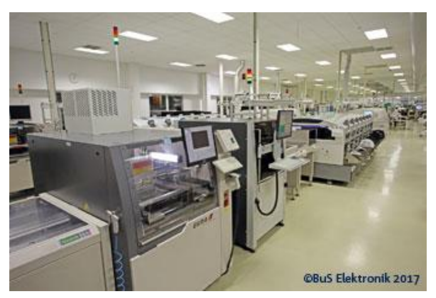
PCB Production line

No matter which soldering process you analyse, all of them have one aspect in common: they produce airborne pollutants, which may have a negative impact on employees, plants and products as well.