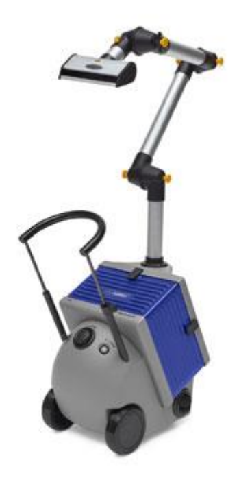
Mobile extraction and filtration unit for solder fume for use at manual work places, JUMBO Filtertrolley 2.0 LRA

Collecting the airborne pollutants is a significant aspect, when running extraction systems for air purification. Close proximity to the source of emission is crucial - the closer, the better. Not only in terms of capturing all particles before they reach ambient air and build up on plants and products, but also to minimise economic expenses. The larger the distance between source of emission and collection element, the higher the necessary suction capacity of the extraction and filtration system – with, in turn, a huge impact on energy consumption.