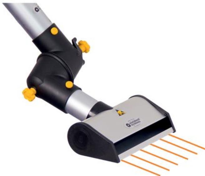
Figure 4: Suction nozzle uses the Coandă effect

Suction nozzles use the Coandă effect, which means that air or gases move along a convex surface instead of detaching and continuing to flow in the original direction of flow. During gluing or cleaning with solvents or when vapors are generated that are heavier than air, these capturing elements are usually positioned flat and to the side of the pollutant source.