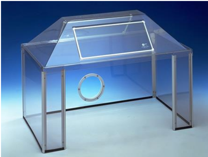
Figure 3: Semi-open extraction cabinet for use, e.g., in laboratories

Half-open systems are enclosures for the pollutant source with an open side for handling and with a connection for air ducts.