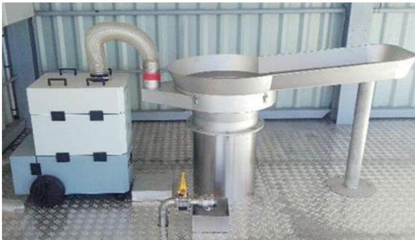
Figure 5: Barrel suction to capture rising dusts

Barrel suction - when filling containers, rising dusts had to be captured. This was done by means of a ring nozzle that surrounds the vessel opening.