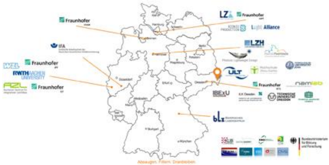
Image: research and development network for additive manufacturing in Germany