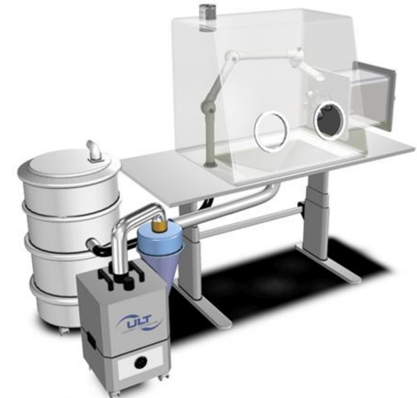
Image: Utilization of an extraction system during post processing

“We are constantly striving to meet the requirements of additive manufacturing by continuously enhancing our modular systems. ‘ULT – air quality’ is ULT’s corporate motto. In order to provide substantial ventilation solution, extensive knowledge on the latest technologies, which we have successfully implemented in various solutions for laser