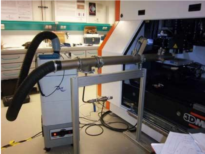
Image 1: To investigate the characterization of the particle phase in an ultra-short pulse laser, a measuring structure consisting of exhaust pipe, measuring path, and LAS 200 exhaust device was installed