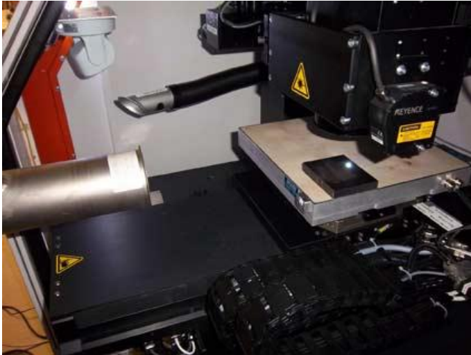
Image 2: During the first step, the influence of repetition rate on particle size distribution, and the number concentration of emissions during processing of stainless steel were investigated.