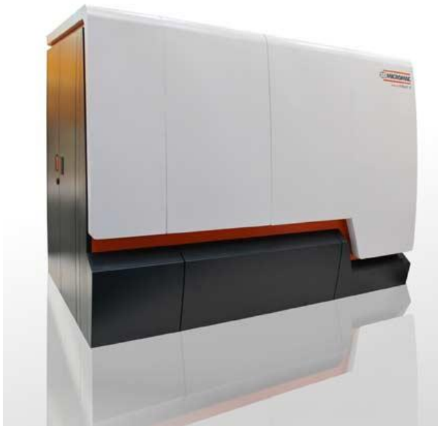
Image 4: 3D-Micromac provided a system with ultra-short pulse laser as experimental object.

At a repetition rate of 200 kHz, ULT discovered similar concentration levels during the processing of stainless steel and silicon. In contrast, when ceramic was being processed, an 80 per cent smaller particle concentration occurred compared with stainless steel processing. When stainless steel and ceramic are processed, particles of a similar size spectrum are released. Conversely, larger particles are discovered when silicon is processed. At a repetition rate of 4,000 kHz, ceramic and silicon processing releases a similar number of particles, while for stainless steel, less particles are generated.